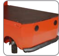
Mechanical parts are enclosed providing protection against external impacts.