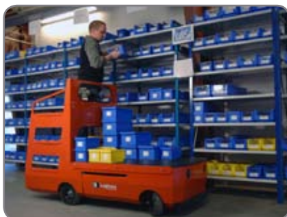
Logirunner being used for order picking. Steps make it easy to reach goods.