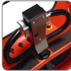
Electronical stepless speed control. Central location of all control buttons.