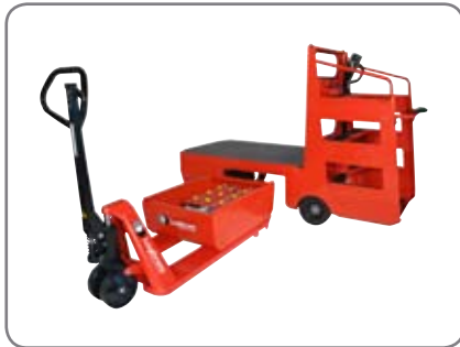
Battery drawer for quick replacement and easy maintenance of the batteries. Perfect for three-shift operation.

Strong construction ensures a long operating life and low maintenance costs.