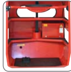
Low entering height for the driver. The pedal acts as a dead man's pedal.