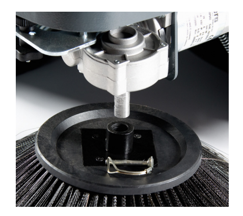
Nilfisk's famous no-tools concept allows fast and easy replacement of brushes and filter for minimal downtime