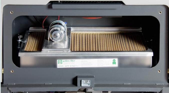
An electrical filter shaking system cleans the filter automatically every 5 minutes