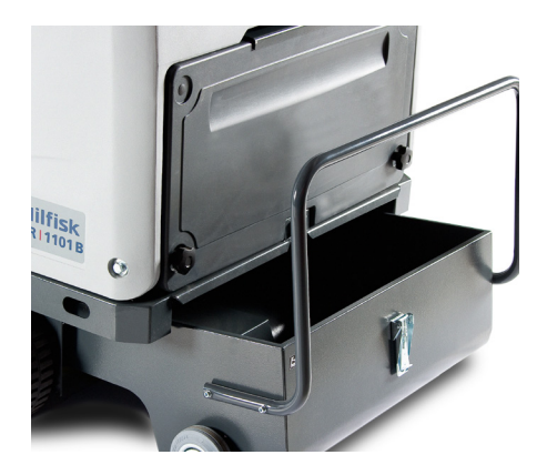
The hopper capacity is extremely large to extend operational time