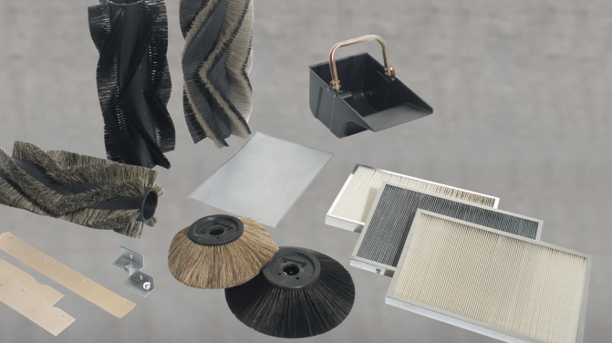
Large range of optional accessories provides the right tools for specific jobs e.g. carpet kit, special filters and brushes, overhead guard, 2x18 litres hopper containers etc.