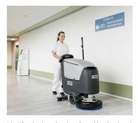
Ideal for daytime cleaning: Sound level reduced to just 60 \pm 3 dB(A) due to new low noise Vac motor system with silent mode setting