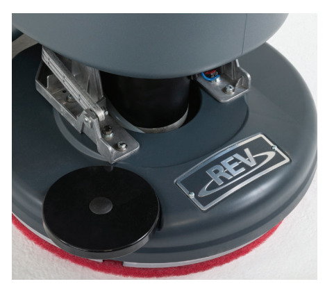
Optional SC500 REVTM orbital scrubbing technology quickly and efficiently attacks dirt from multiple directions leaving the floor cleaner in a single pass