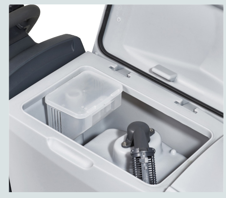
Productive: 45/45 liter water tanks and low energy consumption providing up to 5 hours of running time