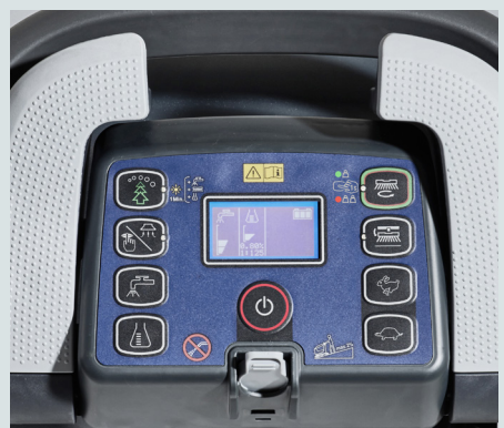
Informative digital display, intuitive icon buttons and new ergonomic drive paddle