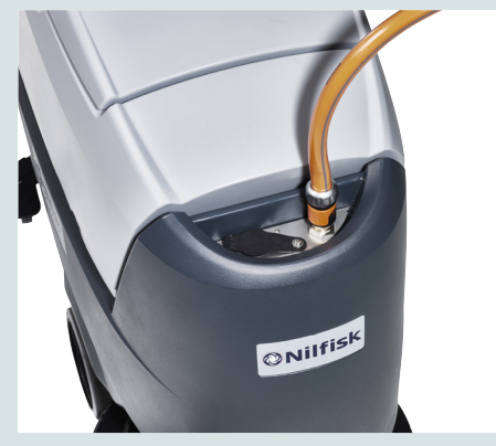
Water filling system with easy connection and automatic shut-off when tank is full (optional)