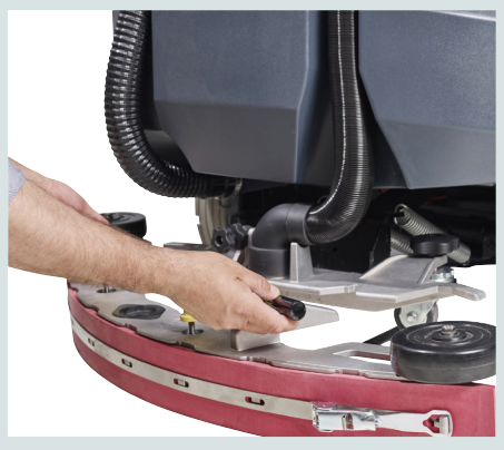
The squeegee is designed to be easily removed from its support using ergonomic handles and there is no hose connection/disconnection needed