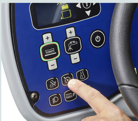
Speed limiter function reduces operator fatigue during cleaning especially when navigating around obstacles