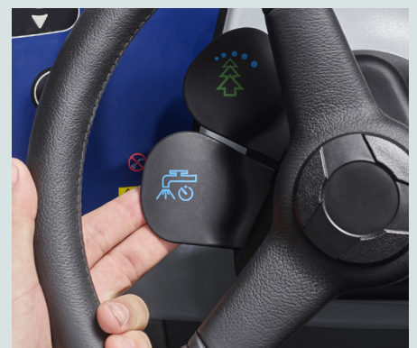
Intermittent SmartFlow™ lever integrated into steering wheel: Reduces water flow on the deck, preventing splashes during turns, lowering consumption and ensuring perfect drying performance